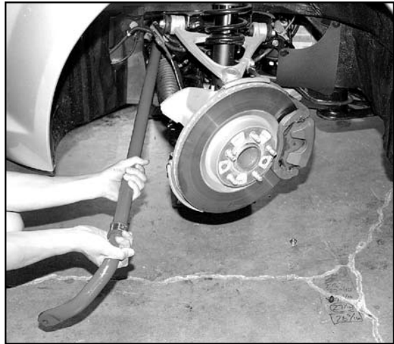
Remove and install bar through the left side of the vehicle.