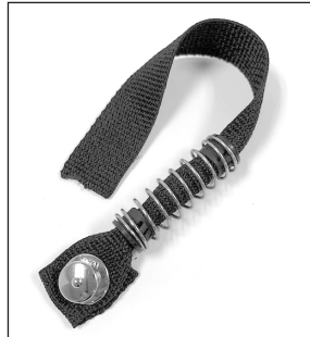
1. Insert the plastic grommet into the deck mounting hole, guide the fabric strap through the grommet, spring and second grommet