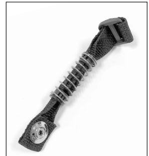
3. Tighten the strap and tuck the remaining material into the spring.