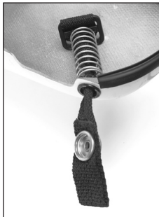
Final Assembly Shown Installed (1999-05 Style)