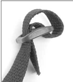
2. Loop the fabric strap through the retaining clip as shown.